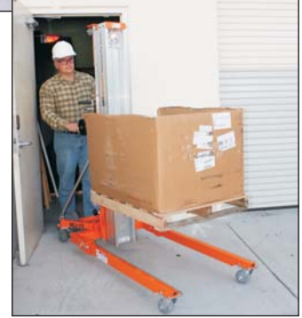
Easy access through standard doorways.