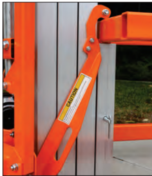
Hold down can be actuated when stabilizers are stowed.